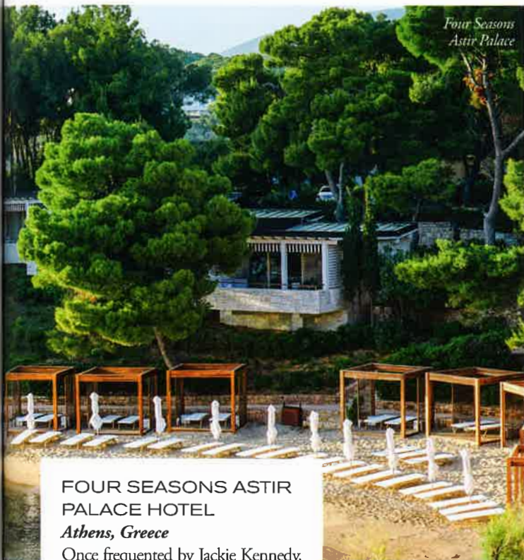
Four Seasons Astir Palace