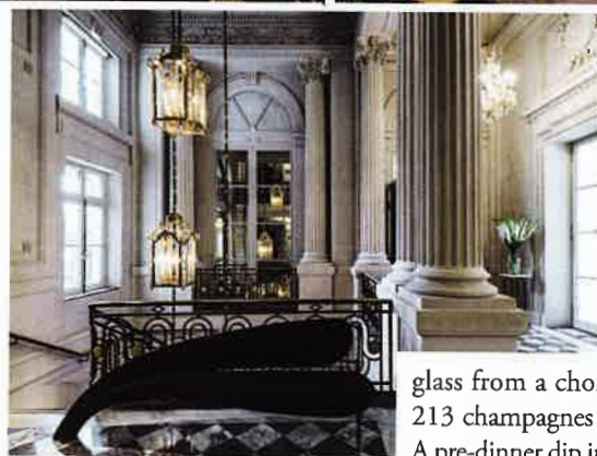
Clockwise from top left, Suite Duc de Crillon; Lauren Bush at a ball at the Crillon in 2000; the hotel's marble interiors

The Crillon, which became a hotel in 1909, today appeals both to the old school and the new guard, following an exacting five-year, expensive restoration (in excess of