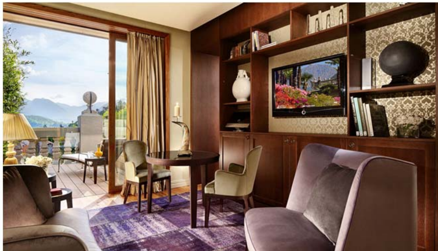
Corner Suite Living Room