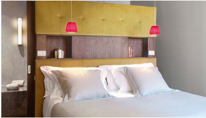
Front Suite Bedroom