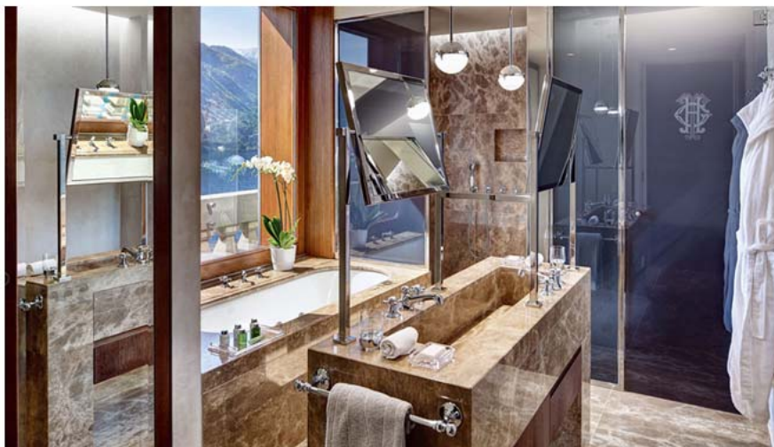
Corner Suite Bathroom