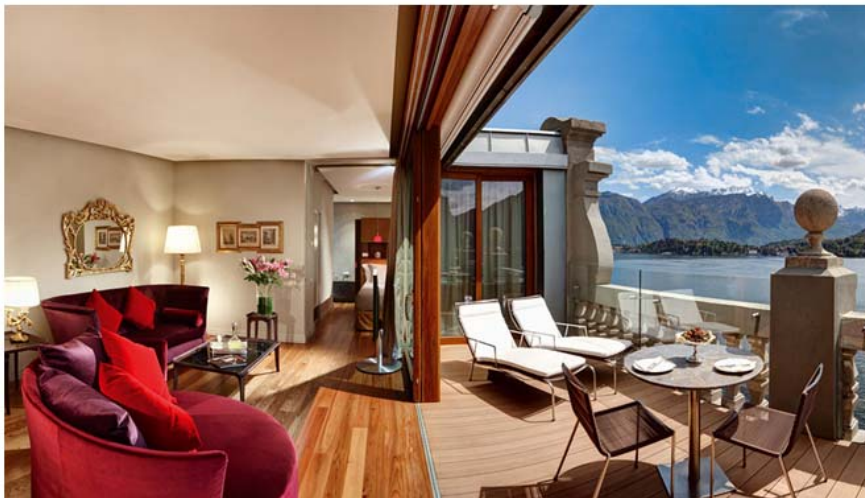
Front Suite Panoramic Living Room