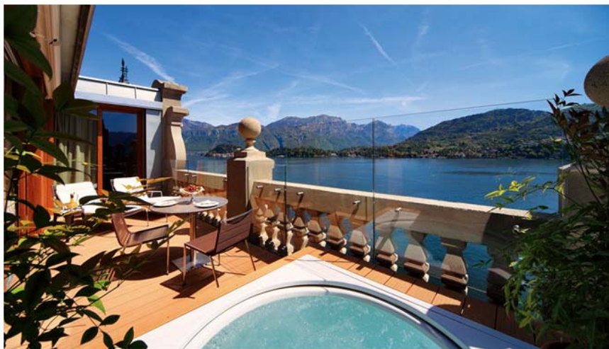
Front Suite Terrace