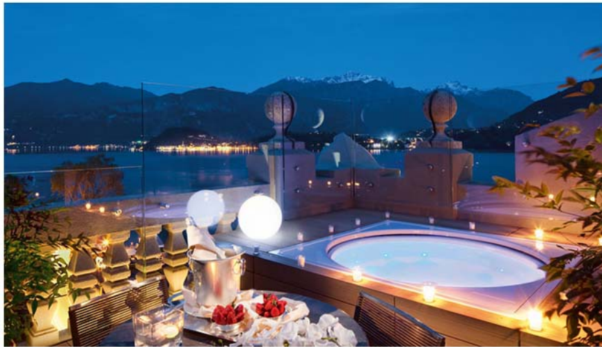
Corner Suite Terrace