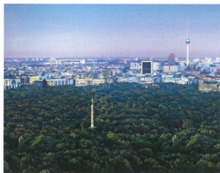
WALDORF ASTORIA BERLIN